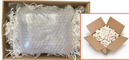
Sufficient bubble wraps & fillers