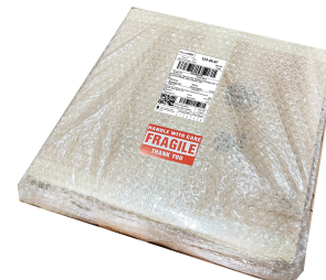
Cling wrap & warning sticker on the box