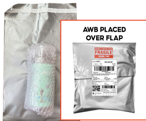
Correct pouch size