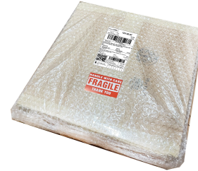
Cling wrap & warning sticker on the box