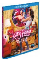
E.g. Music album