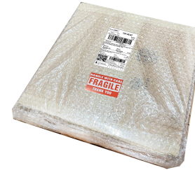
Cling wrap & warning sticker on the box