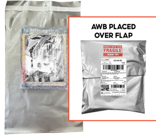
Correct pouch size