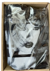
Correct box size