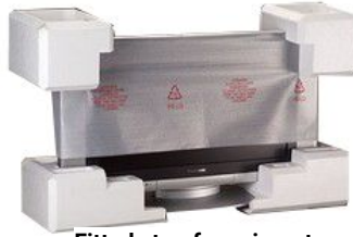
Fitted styrofoam inserts