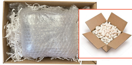
Sufficient bubble wraps & fillers