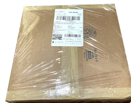
Cling wrap on the box