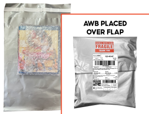
Correct pouch size