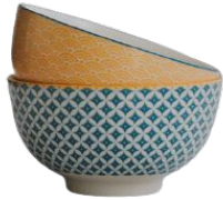
E.g. Ceramic bowls