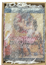
Correct box size