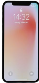
Fragile and breakable